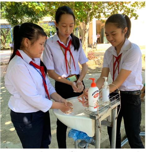
Binh My students are able to wash their hands because of the new filtration system funded in 2019.