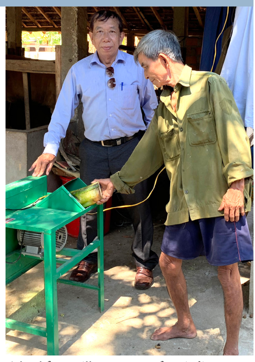
A local farmer illustrates use of a grinding machine. These will be instrumental in grinding agricultural bi-products and forage such as banana trunks into animal feed.

Stay connected with us through our website, www.mqivietnam.org info@mqivietnam.org P.O. Box 1461, Madison, WI 53701-1461 608-239-7575 Madison Quakers, Inc. is a non-profit 501(c)3 tax exempt organization. EIN 39-2004266.